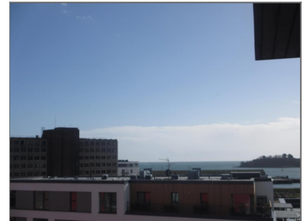
View of the Sea from the Balcony

En-Suite Shower Room - Partially tiled bathroom with white suite comprising: