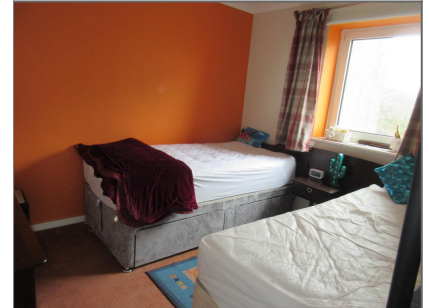
2nd Bedroom (Twin)

Stand alone cooker, washing machine, under counter fridge, stand alone upright freezer, tumble dryer and microwave.