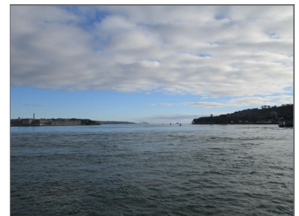
View across to Plymouth Sound - Nearby