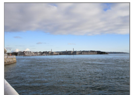
View across to Royal William Yard