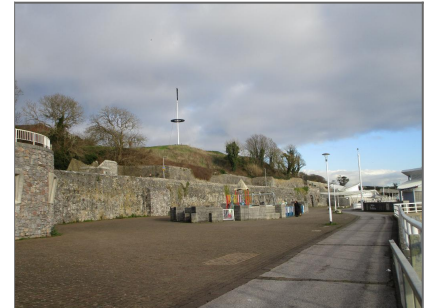
Coast Path Walk - nearby