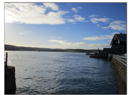
View across Tamar Estuary Nearby